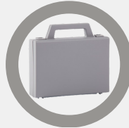
Aluminium Grey 017